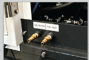
8 | External Fuel Tank Connections with 3-Way Selection Valve

IMPROVE FUEL ECONOMY // LOWER CARBON EMISSIONS // REDUCE NOISE LEVELS THE INDUSTRY'S HIGHEST-QUALITY HYBRID POWER SYSTEMS