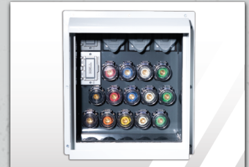
2 | Simultaneous Voltage Output Panel 120V - 20A x 2 | 240V - 50A x 3 1Φ 240V & 3Φ 208/480v Cam-Loks™