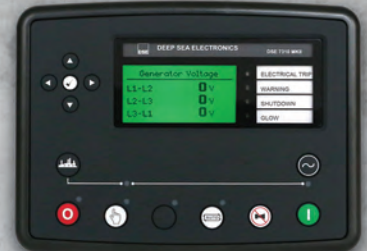
1 | DSEgenset® Digital Control Panel Model 7310 MKII