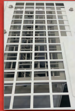
Optional SmartLoad™ System Inside Air Discharge Chamber