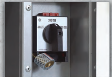
7 | Lockable Voltage Selector Switch 3Φ 277/480V & 139/240V-120/208V 1Φ 120/240V