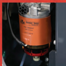
Fuel Filter Heater