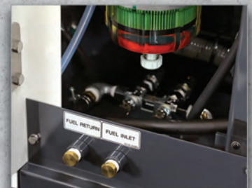
9 | External Fuel Tank Connections with 3-Way Selection Valve