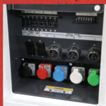
Single Row Cam-Loks™