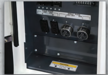
2 | Single-Phase Receptacles 120V - 20A x 2 | 240V - 50A x 2 Optional Cam-Loks™ Available (See Back)