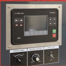
Paralleling Control Panel