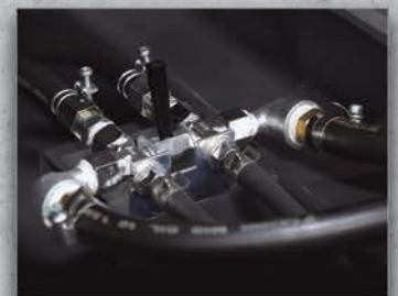
9 | External Fuel Tank Connections with 3-Way Selection Valve

BEST-IN-CLASS dBA RATING // 24-HOUR RUNTIME // EXCELLENT MOTOR STARTING THE INDUSTRY'S HIGHEST-QUALITY MOBILE GENERATORS