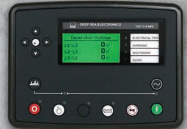
1 | DSEgenset® Digital Control Panel Model 7310 MKII