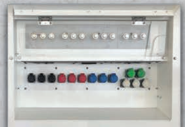
3 | Three-Phase Output Panel Optional Triple Row Cam-Locks™ Shown