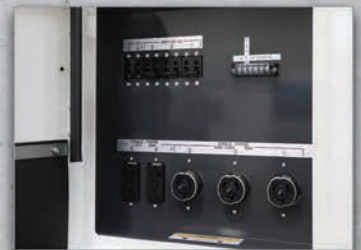
2 | Single-Phase Receptacles 120V - 20A x 2 | 240V - 50A x 3