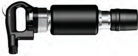
MAC30 RB utilizes standard 11x Jumbo-type consumables, including: upper sleeves, lower sleeves, bumpers and springs