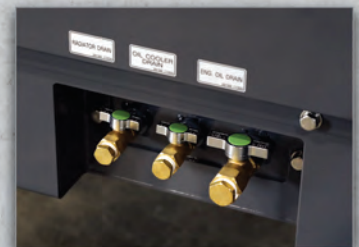
12 | Exterior Service Drains Quick drain valves for the Radiator, Oil Cooler and Engine Oil fluids