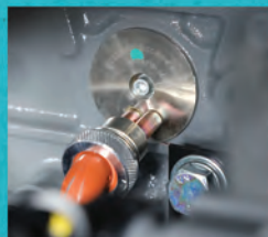
Engine Block Heater