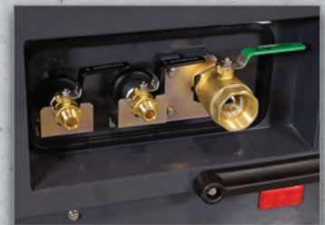
3 | Air Connections 3/4" Ball Valve x 2 | 2" Ball Valve x 1