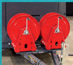
Double Hose Reel Kit