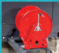
Single Hose Reel Kit