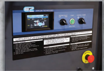
1 | Digital Touch Screen Control with Start button & Pressure Selector switch