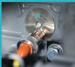
Engine Block Heater