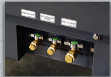
12 | Exterior Service Drains Quick drain valves for the Radiator, Oil Cooler and Engine Oil fluids