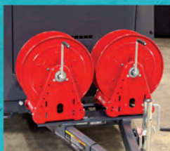
Double Hose Reel Kit