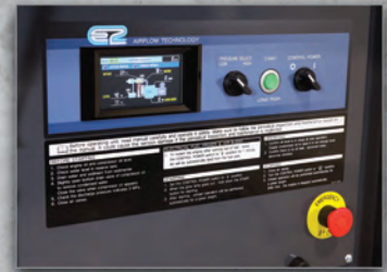
1 | Digital Touch Screen Control with Start Button & Pressure Selector Switch