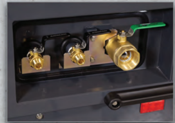
3 | Air Connections 3/4" Ball Valve x 2 | 2" Ball Valve x 1