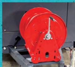
Single Hose Reel Kit