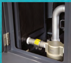
Integrated After Cooler