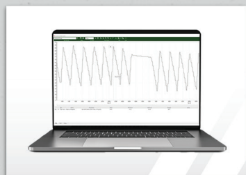
6 | Telematics Monitoring System Remote access and monitoring of fuel, runtime, GPS, load and more