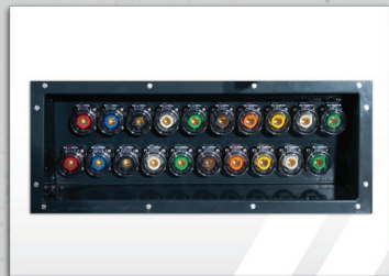
2 | Simultaneous Voltage Output Panel 120V - 20A x 2 | 480/208V 3Φ Cam-Loks™