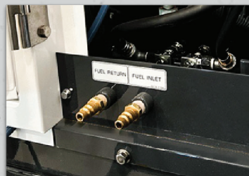
8 | External Fuel Tank Connections with 3-Way Selection Valve