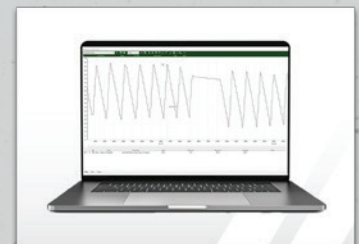
6 | Telematics Monitoring System Remote access and monitoring of fuel, runtime, GPS, load and more