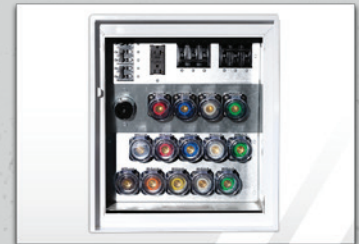
2 | Simultaneous Voltage Output Panel 120V - 20A x 1 | 240V - 50A x 1 1Φ 240V & 3Φ 208/480v Cam-Loks™