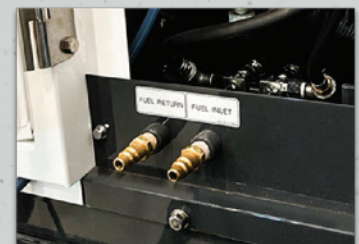
8 | External Fuel Tank Connections with 3-Way Selection Valve

IMPROVE FUEL ECONOMY // LOWER CARBON EMISSIONS // REDUCE NOISE LEVELS THE INDUSTRY'S HIGHEST-QUALITY HYBRID POWER SYSTEMS