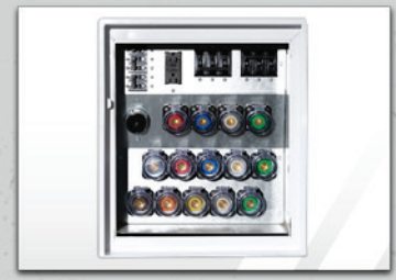
2 | Simultaneous Voltage Output Panel 120V - 20A x 1 | 240V - 50A x 1 1Φ 240V & 3Φ 208/480v Cam-Loks™