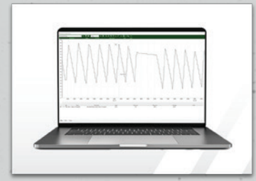
5 | Telematics Monitoring System Remote access and monitoring of fuel, runtime, GPS, load and more