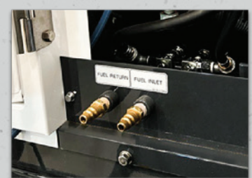
7 | External Fuel Tank Connections with 3-Way Selection Valve