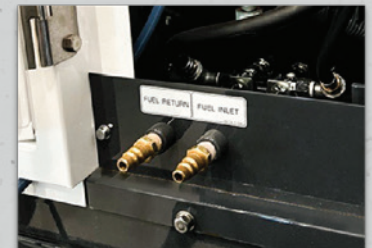
8 | External Fuel Tank Connections with 3-Way Selection Valve

IMPROVE FUEL ECONOMY // LOWER CARBON EMISSIONS // REDUCE NOISE LEVELS THE INDUSTRY'S HIGHEST-QUALITY HYBRID POWER SYSTEMS