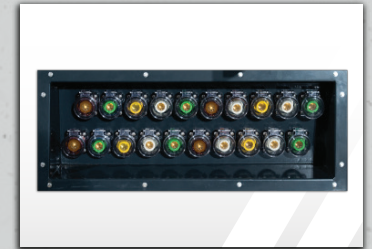
2 | 480V 3-Phase Output Panel 120V - Courtesy Outlets | 480V 3Φ Cam-Loks™