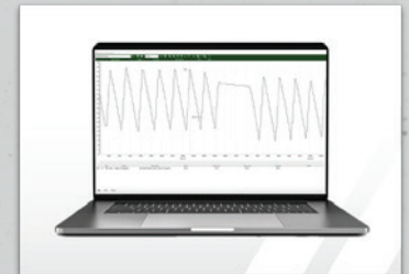
6 | Telematics Monitoring System Remote access and monitoring of fuel, runtime, GPS, load and more